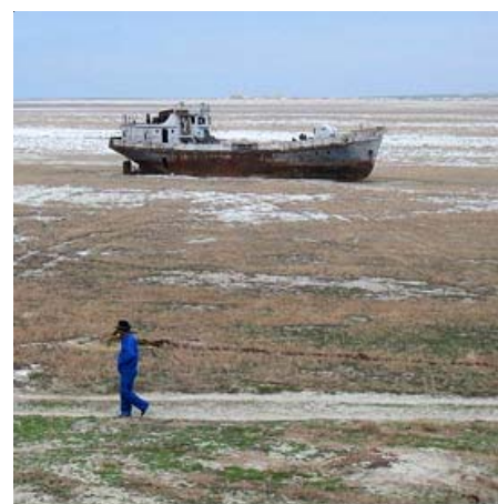
Aral Sea, Kazakhstan

The introductory section covers many more disasters than those which are highlighted in the following sections: Wittenoom in Australia; Guiyu, the e-waste village in China; the Toulouse Chemical Factory Explosion in France; India's Bhopal Industrial Disaster; the Lusi Mud Volcano in Indonesia; the dioxin disaster in Seveso, Italy; the Great Pacific Garbage Dump; Papua New Guinea's Ok Tedi River; the Gates of Hell in Turkmenistan; Chernobyl in Ukraine; America's Berkeley Pit Lake, Centralia Underground Coal Fire, Love Canal and Picher, Oklahoma. Teachers can find a wide selection of classroom resources in the final section.