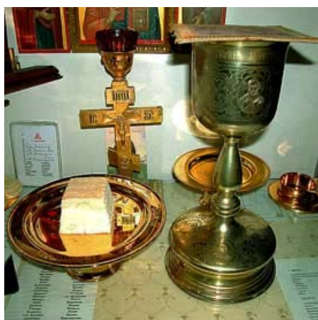
The bread and the wine

This fascinating topic looks at how food is incorporated into worship in the major religions, Buddhism, Christianity, Hinduism, Judaism and Islam.