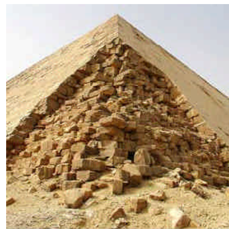
Bent Pyramid, Old Kingdom