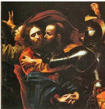
The Taking of Christ by Caravaggio

Designed for Religious Education students, this topic would also be excellent for art history. Beginning with a lengthy list of comprehensive sites, there follows a section on Jesus depicted as a hero. The art periods and styles which are highlighted are early Christian art, Byzantine, Medieval, Baroque, Renaissance, Pre-Raphaelite and non-Western. The final two sections covering images and painting from the 20th-21st centuries are duplicated from the companion topic, Portraits of Jesus: 20th-21st Centuries, which examines in detail depictions of Jesus in the literary and performing arts as well as the visual arts. A selection of lesson plans and classroom materials is available for teachers at the end.