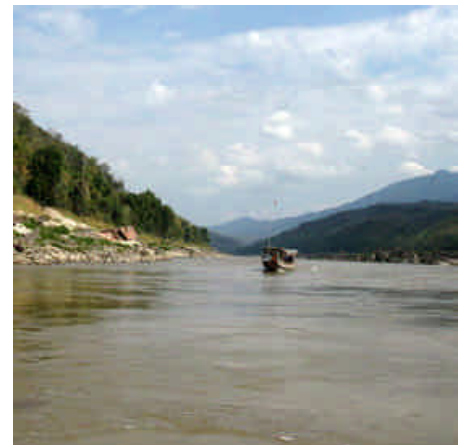
Mekong River, Laos

the Niger and Nile Rivers of Africa, the Pilcomayo, Parana River and Bio Bio Rivers of South America, the Ganges, Cauvery and Indus Rivers of the Indian subcontinent, the Rhine and Danube Rivers of Europe, the Litani, Jordan and Tigris-Euphrates Rivers in Middle Eastern countries and the Mekong River of Indo-China. Various lesson plans are available in the For Teachers section.