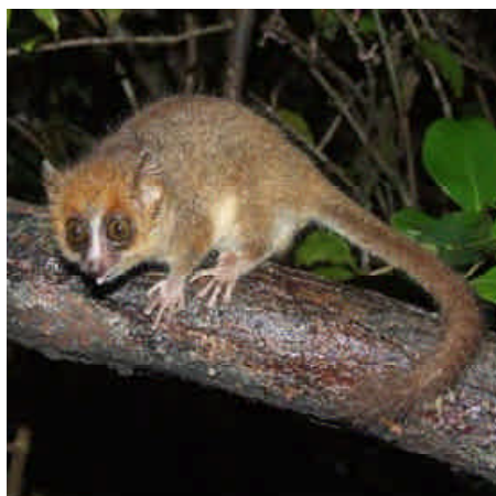
Mouse lemur, Madagascar rainforest

geoglyphs of Nazca and Pampas de Jumana in Peru and the historic town of Zabid in Yemen. Natural areas of global significance covered are Heard and McDonald Islands in Antarctica, the Belize Barrier Reef Reserve System, the Kahuzi-Biega National Park in the Democratic Republic of the Congo, Mont Perdu in the Pyrénées of southern Europe, the rainforests of the Atsinanana in Madagascar, and the Everglades National Park in the USA. Classroom resources are available in the final section as usual.